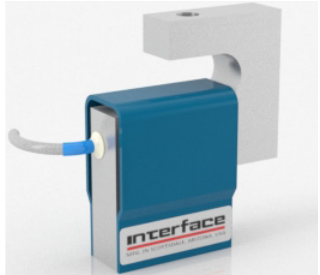
Model SM (shown)