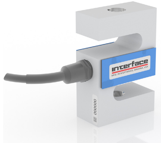
MODEL SSM-FDH (Shown)