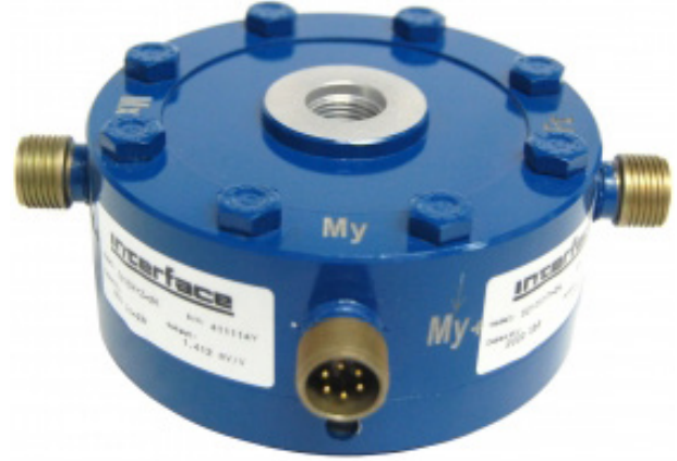
Model 5200 (shown)