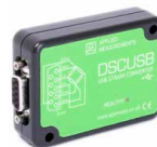
DSC-USB USB Signal Digitiser