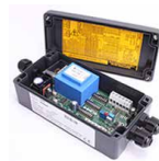
SGA Signal Conditioner/Amplifier