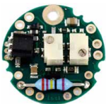
ICA Miniature Strain Gauge Amplifier